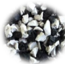
50% Black 50% Grey