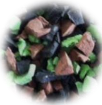
50%Black 25%Brown 25% Green