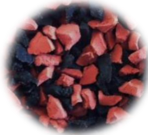
50% Red 50% Black