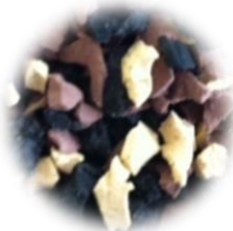
50%Black 25%Brown 25% Beige