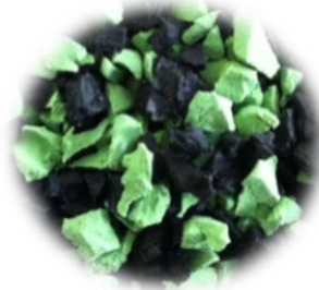
50% Green 50% Black