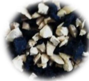
50% Beige 50% Black